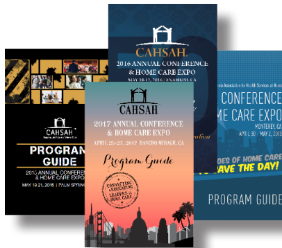
B & W PRINT WITH COLOR COVERS 5.5" x 8.5" PORTRAIT