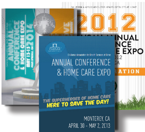
FULL COLOR PRINT 8.5" x 11" PORTRAIT